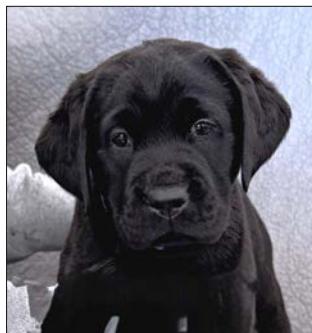
Tuscon, Barb's puppy in training

Please sign up at the Gathering Table in the Atrium if you plan to attend.