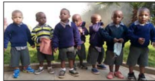
Little students at Happy Life.