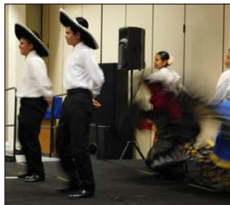
Panamerican students showcase the dance troupe.