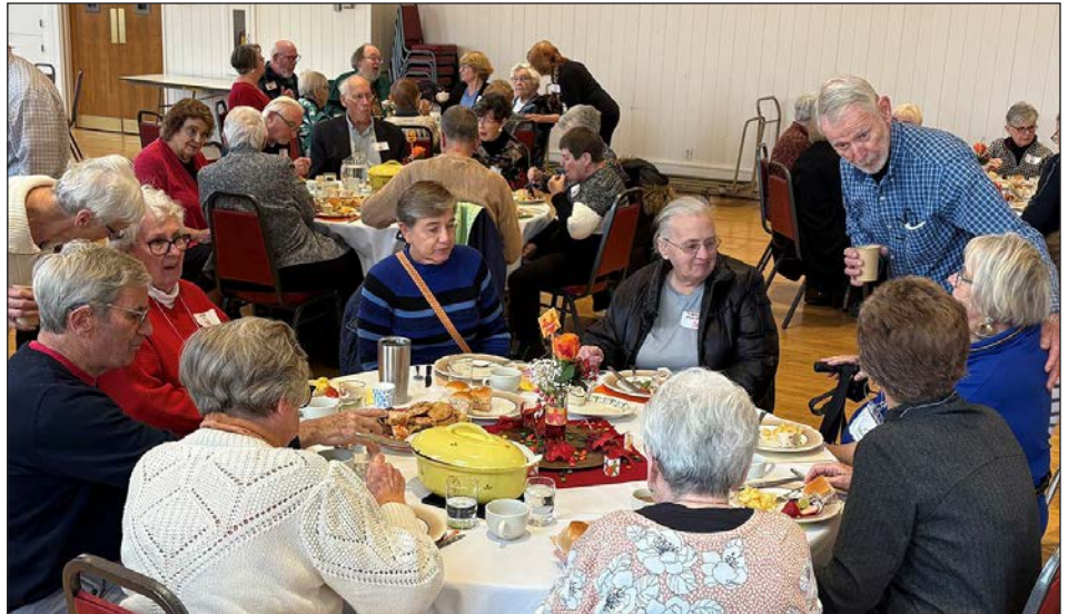
Great food and fellowship was enjoyed at the Stay Connected Luncheon on November 9 th .