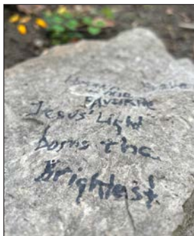
A stepping stone in the First Church garden has these words: "Jesus' Light burns the brightest." We share our belovedness with Jesus, and we can share this brightness with each other and with ourselves too.

In my own life journey, I continue to learn and find that when I love myself more and claim God's goodness in me — my baptismal identity in God — it's easier to live into the gifts of my own imperfections, and those of others, too. When God spoke humans into being, God recognized this act as "very good." And I believe we, too, are invited to claim our very own goodness. If we see ourselves as flawed, we'll be reluctant to embrace our true identity, and we will resist leaning on God, or others, or ourselves. We will resist resting in God. And, on the other hand, if we see ourselves as good, we'll be more open to resting in God, in each other, and in ourselves.