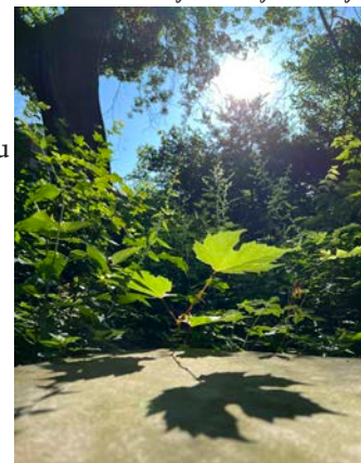
Photo taken beside the memory benches, nestled in our First Church gardens

Entering into reflection and deep time with God during an early morning