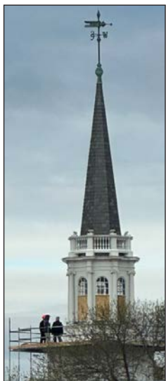
Restoration of the steeple.