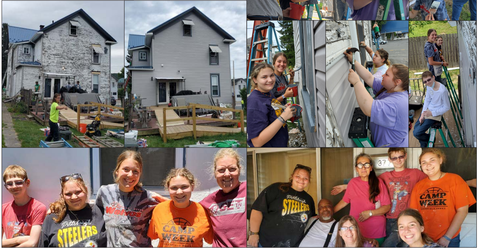
Our 2022 Mission Team making a positive impact in the Jonestown area.

We are excited to return to Pennsylvania to serve those in need! We will again be working with Hosanna Industries and will improve the homes (and lives!) of people in the Jonestown area. Our team will head out on Sunday morning, June 25th and return home on Saturday, July 1st. We are heading out to be the helping hands and open hearts that God has called us to be, and I know that we will have a positive impact on all of those we serve!