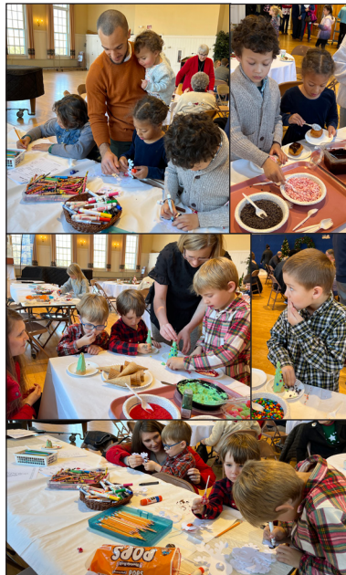
Christmas Kringle Coffee Hour

Sunday, January 8, 15, 22 & 29 for grades 6 – 12 Teens will begin in church with their families during 10 am worship and dismissed to PF during the service.