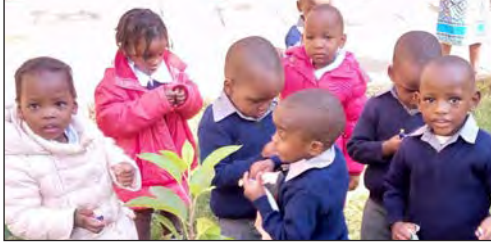
Toddlers were excited for the first day of school at Happy Life Mission.

The Happy Life Mission is a non-profit Christian organization whose main vision is to give hope to abandoned children in Kenya through its three-fold ministry: