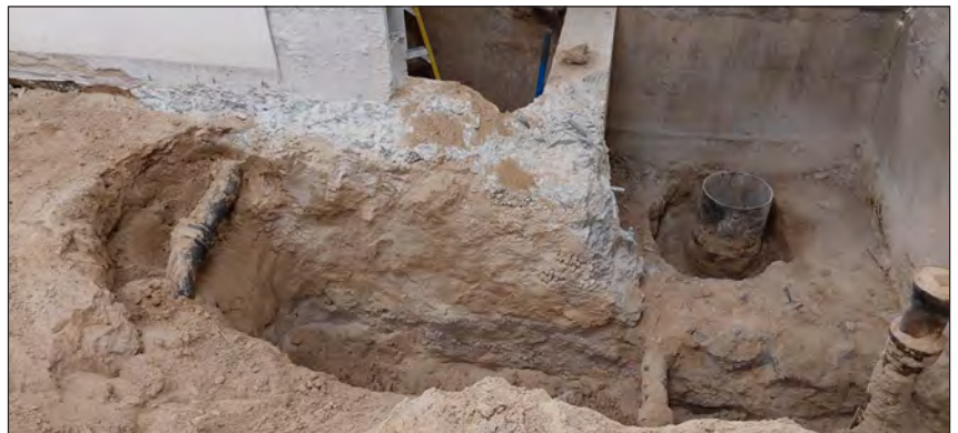
Picture #2 (above) shows the excavation in LL3 for the new south wall foundation at 7 am on May 11 looking North with the shaft divider foundation at top center and old pit to the right.

The east wall is at top, CE office is behind billowed protection at the right.