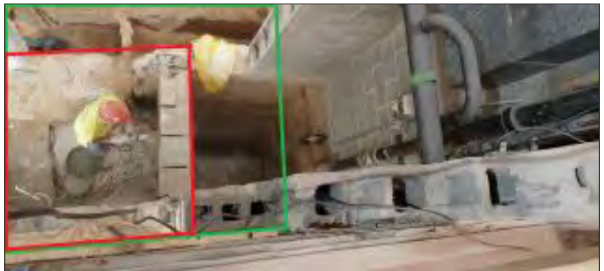
Picture #3 (above right ) looking down from 1st floor shows the progress on sawing the shaft divider foundation wall at 1 pm on May 11.

The relocated steam pipe is at the right in the picture. The location of old elevator shaft is outlined in RED and new elevator shaft in Green).