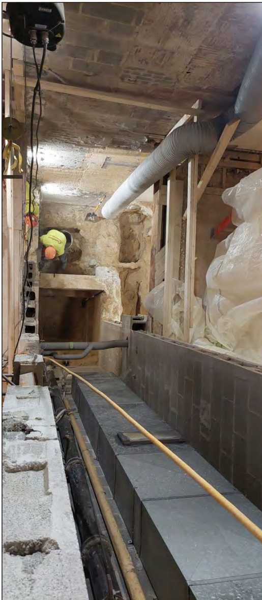
Picture #1 (left) is looking from 2nd floor down to the pit where the shaft divider foundation is being sawed at 8 am on May 11

The east wall is at top, CE office is behind billowed protection at the right.