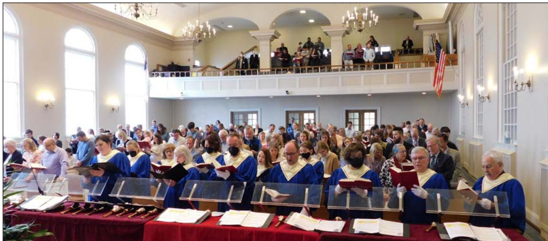
Joyous attendance and service Easter morning.