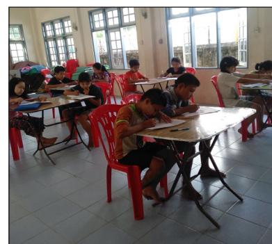
Children study during summer school class.