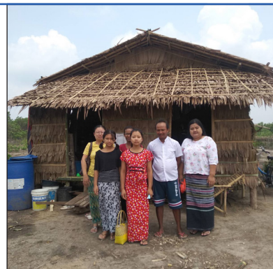
Staff before the new home cell church in Pago.

Please continue to pray for the CCM staff and the people it serves.