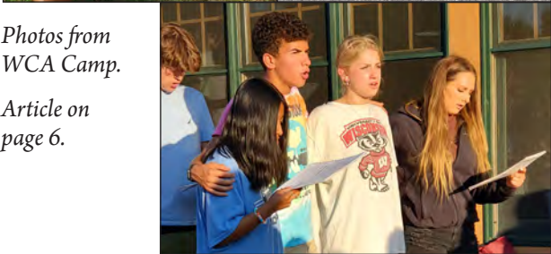
Photos from WCA Camp. Article on page 6.