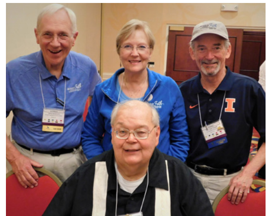
Plymouth 400 Task Team

The people at First Church would have been real proud at the closing meeting when the National Association recognized the latest