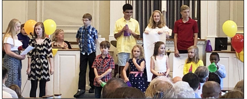
The 3, 4, and 5-year-olds and 1st and 2nd grade Sunday School classes entertained the congregation. (left)