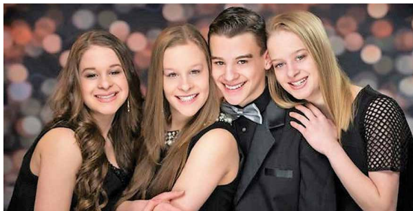
FEBRUARY 10, 2019 Vintage Mix

2019 Free Concert Series - held on select Sundays at 4 O'clock. Bring a guest and enjoy some great music.