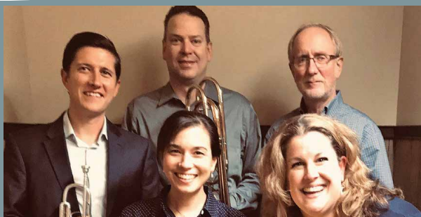
MARCH 10, 2019 Milwaukee Symphony Brass Quintet