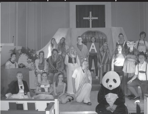
The Christmas Eve Play, put on by Jr. & Sr. High Students, was part of the 4 PM worship service.